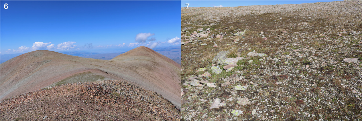
Figures 6–7. Type locality of Psammitis abuliensis sp. nov. in Georgia, Didi Abuli Mt. (6 – sampling area; 7 – sampling plot).

Xysticus marmoratus Mcheidze, 1997: 163, figs 305–306 (♂).